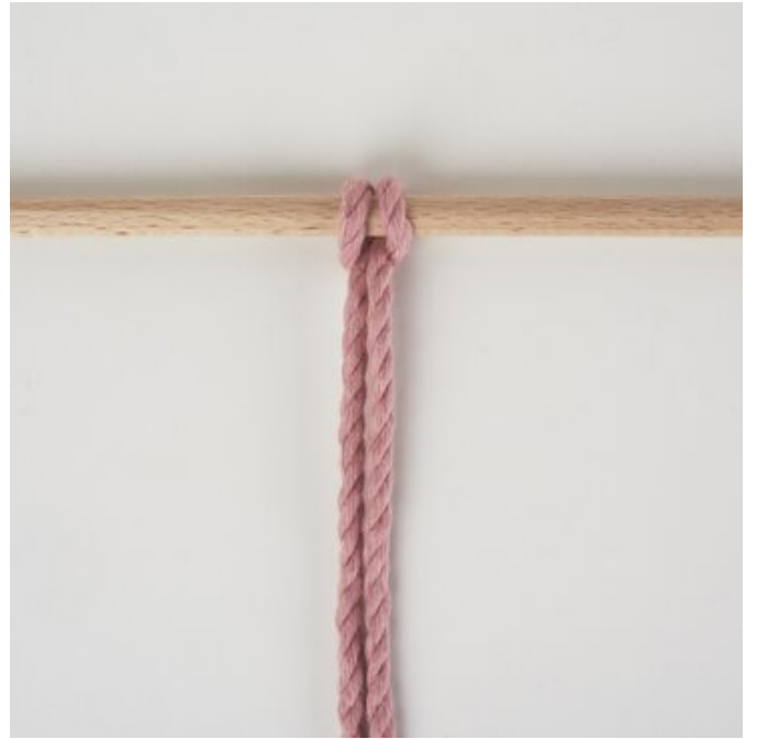
Lark's head knot backwards