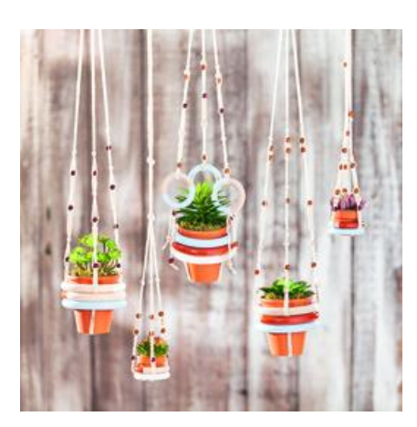
Matching this idea, you can create another hanging basket Macramé-with a only little chalky paint, small wooden rings and mini terracotta pots: read our instructions no. 1469