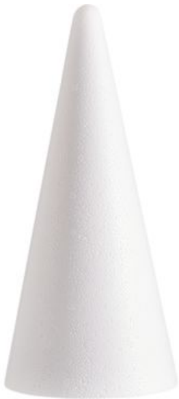
Polystyrene cone 26 cm