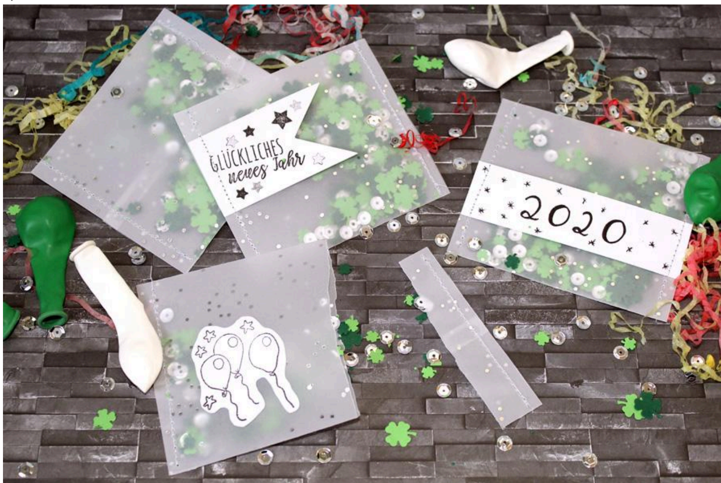
Step 1: Prepare the confetti bags

Look forward to making New Year's Eve or any other special event even more unforgettable with homemade confetti bags! In these instructions, you will learn how to make creative and individual confetti bags from simple materials. These original bags are not only suitable for the turn of the year, but also wonderful as gift idea or for birthdays and weddings. Let your creativity run wild and surprise your friends and family with something really special.