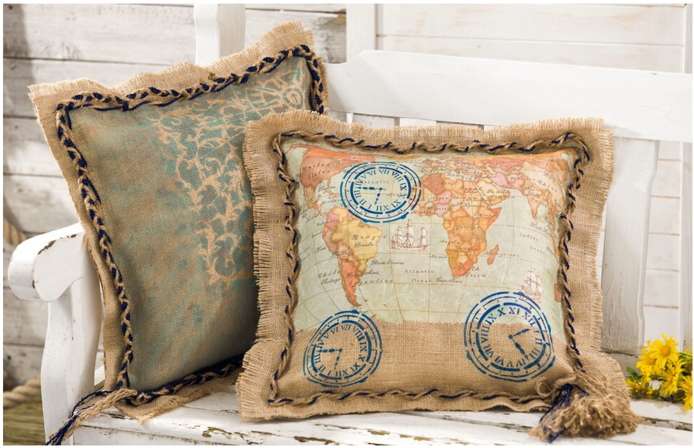
Pillow "World Map"

These creative pillows do not only please globetrotters. They are designed with Motif straw silk and Fabric paint on rustic plucking. The motifs are simply stenciled on.