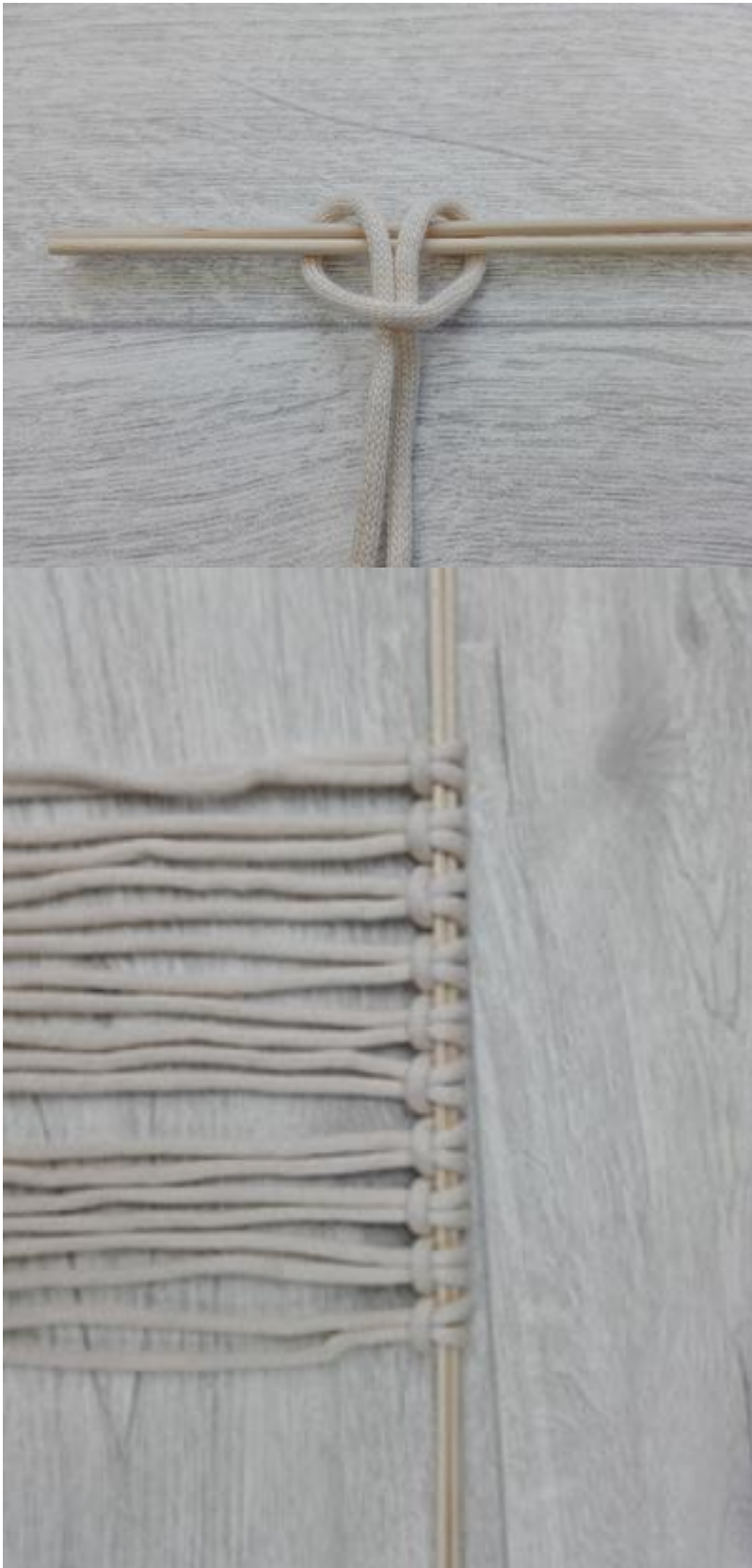
Step 1: The "Basic Knot"