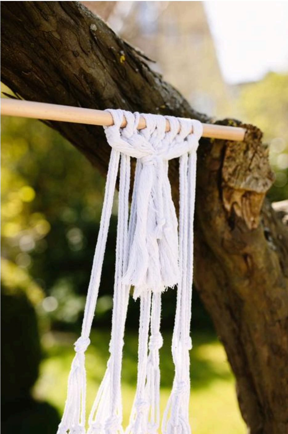
Knot very tightly and tie decorative knots