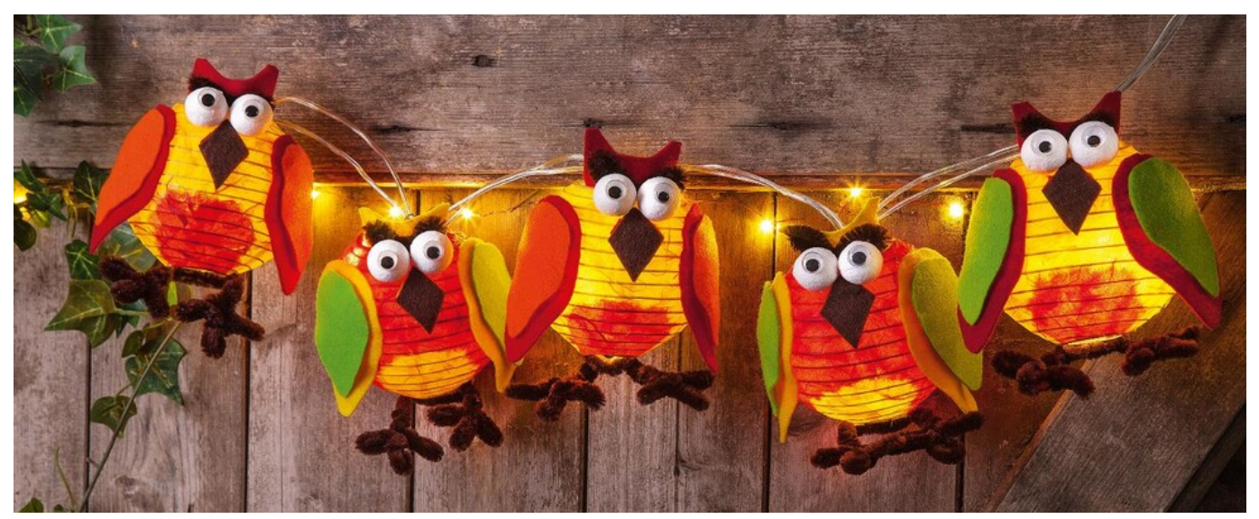
A funny owl light chain of lampshades for your home.