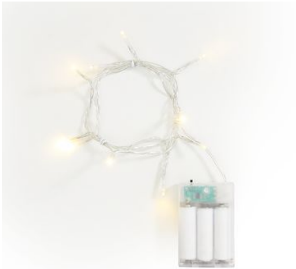
VBS Mini LED chain of light "10 LEDs", with timer