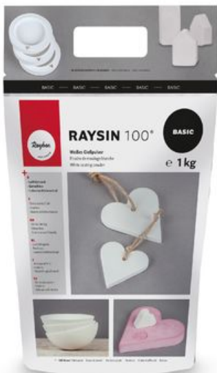
Casting powder "Raysin 100", white, 1 kg