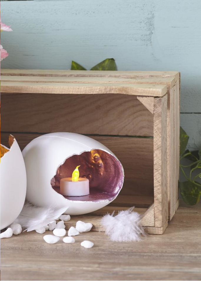
Explained step by step