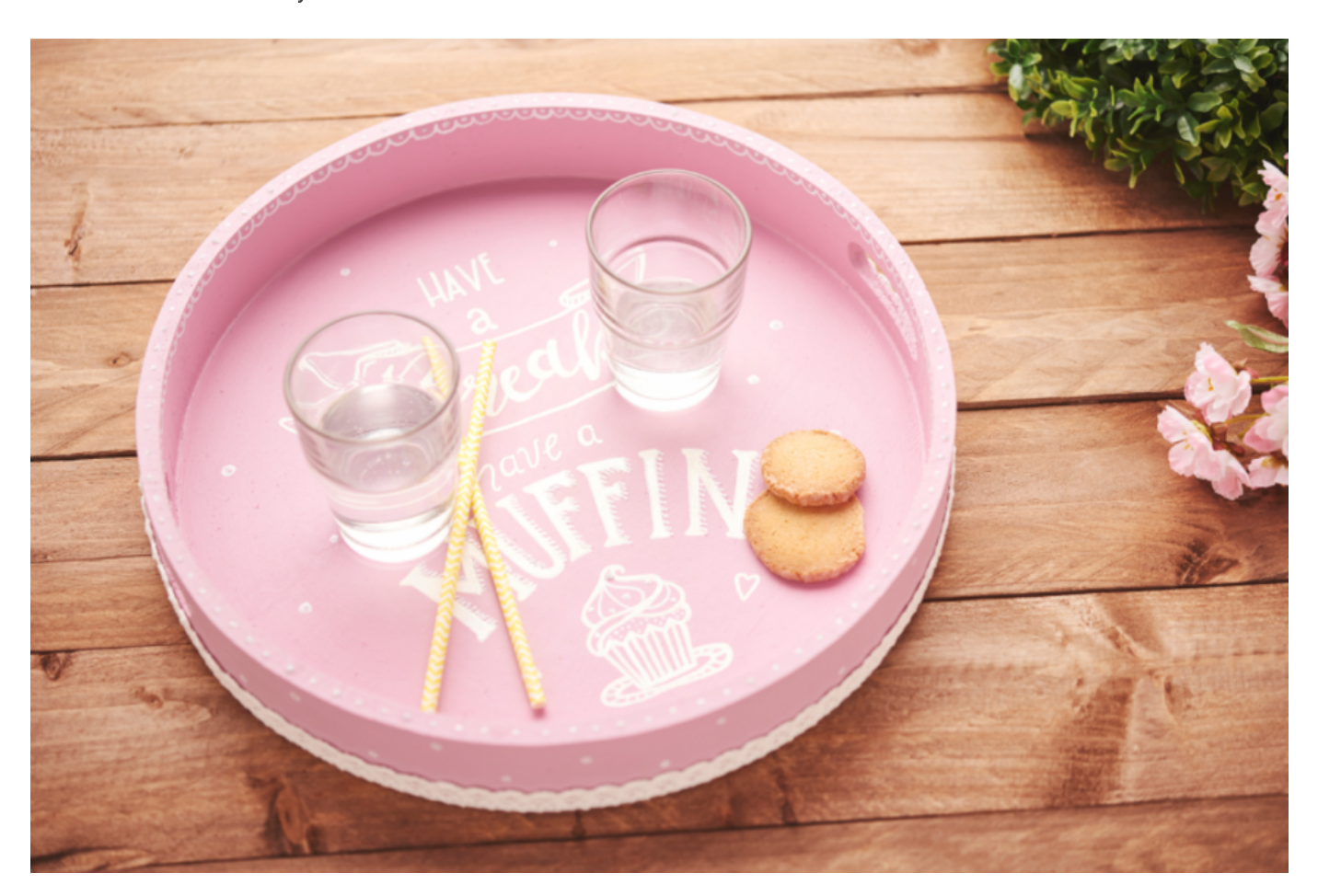
The handlettering on the tray is as simple as this

The round handlettering tray is sure to be the new favourite! With the help of the template, the beautiful muffin motif is drawn by hand.