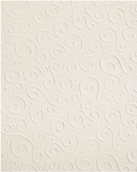
Embossed cardboard Milan, approx. 50 x 70 cm, 220 g/sqm, Champagne