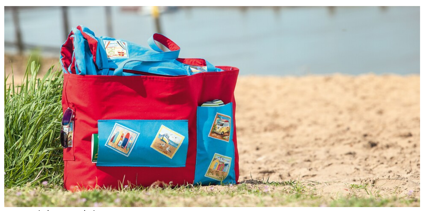
And this is how you do it

In this large bag there is room for everything you need for a trip to the bathing lake, even the large self sewn beach sheet. Especially practical are the small patch pockets that keep glasses, flip-flops, magazines and the like handy.