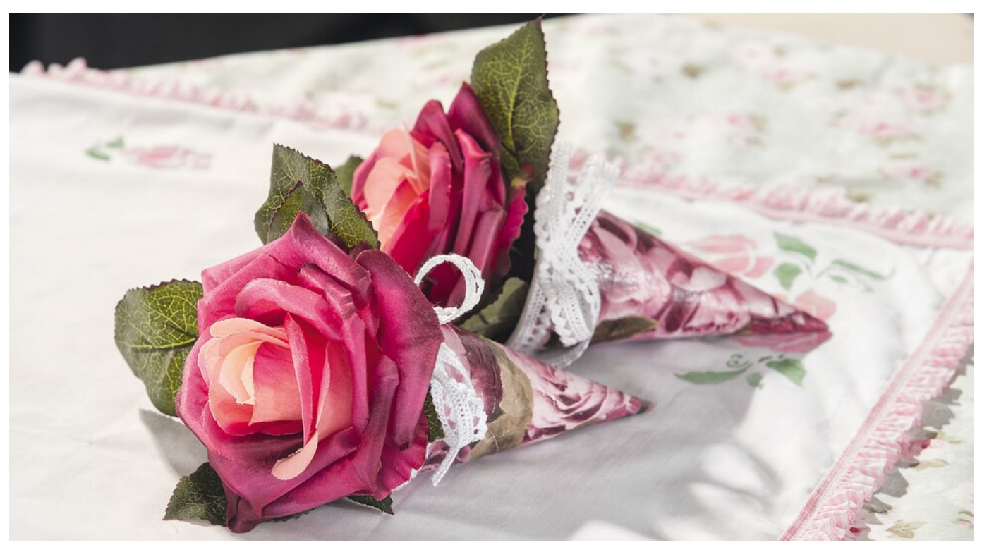
Here's how it works

Quickly made is this classic romantic table decoration, which enhances every festively set table enormously. And the rose bags are also a distinctive decoration in themselves, which fits well anywhere.