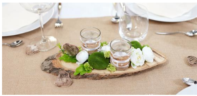
Table arrangement on tree disc

Cover the tealights with double-sided Adhesive tape with a decorative ribbon : a festive ribbon and classic white Satin ribbon. Natural-coloured Yarn harmonise perfectly with it. Wrap the lower part with string, Adhesive tape also helps to fix it in place