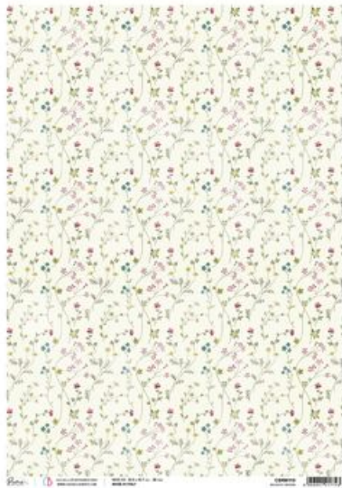
Motif straw silk "Flower Shop - Delights Garden"