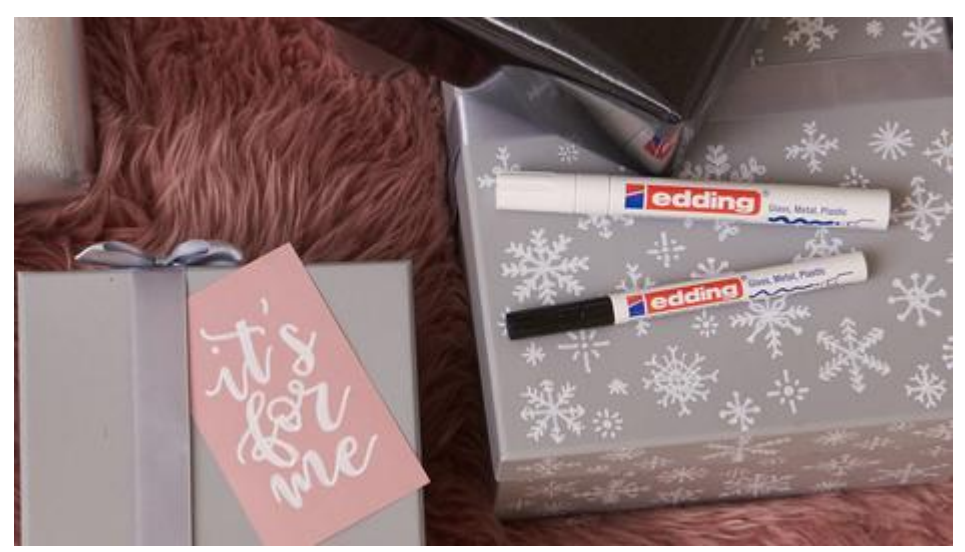
For this packaging, we used silver-coloured wrapping paper and let white snowflakes trickle onto the paper. We used the white edding 780 with an extra-fine tip. There are no limits to your imagination when designing.