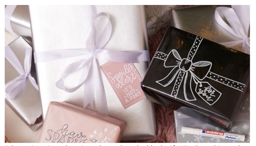
A large, imaginary bow is enthroned on the black gift. We drew this on the paper with the silver-coloured edding 751 and added a matching gift tag.