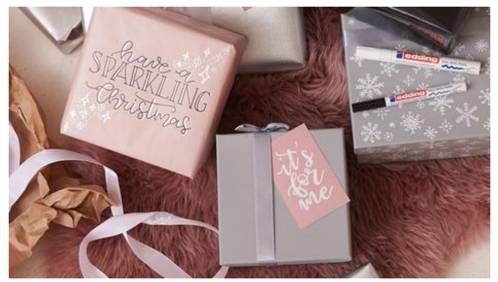
We wrote on the pink package with the black edding 780 and then emphasised individual letters with white shadows (with edding 751).