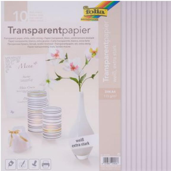
Vellum paper, 10 sheets, White