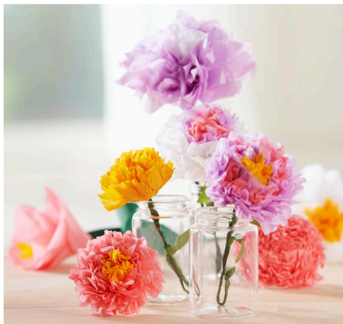
Flowers from Silk paper