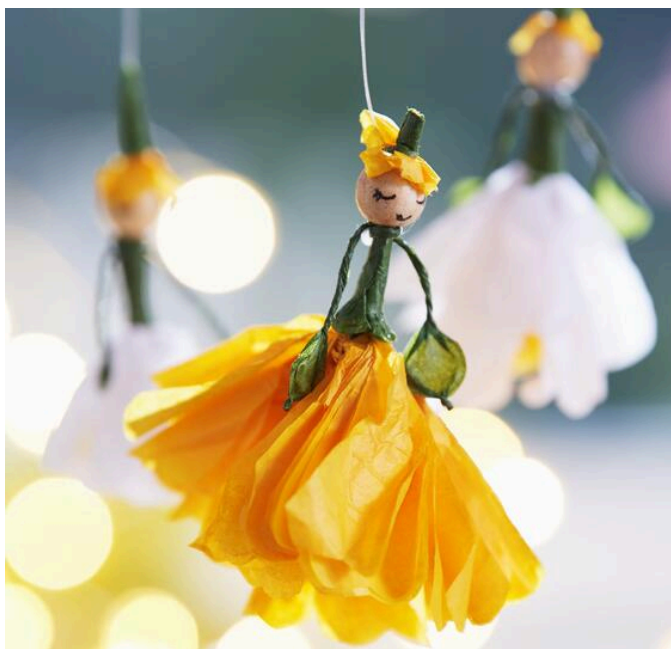
Fairies from Silk paper

Discover more great ideas from Silk paper: