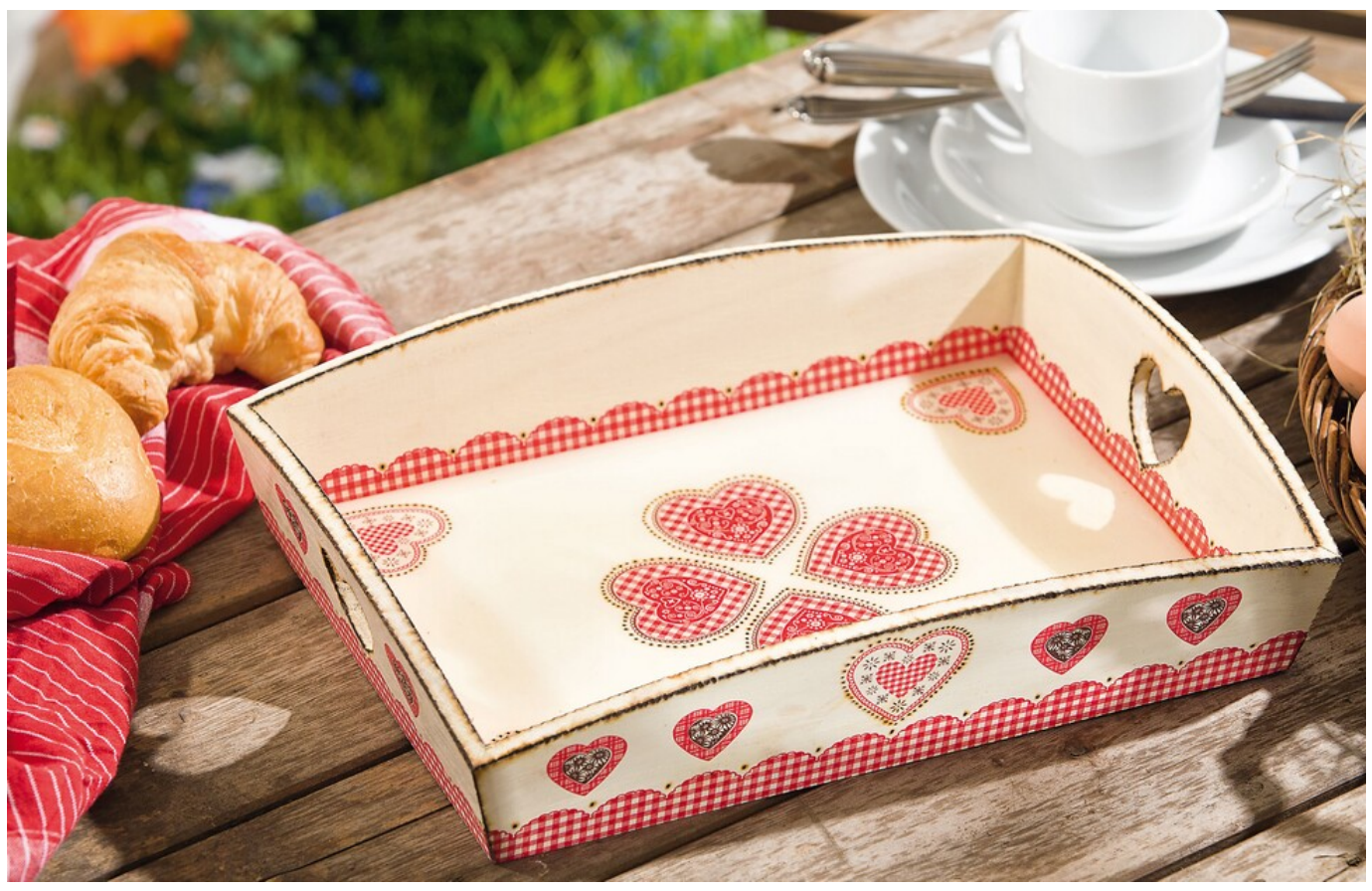
It's that simple

Napkin technique and Wooden burning are tastefully combined in this heart-shaped tray in alpine look. A cold glaze coating provides additional protection and gives the tray a particularly shiny appearance.