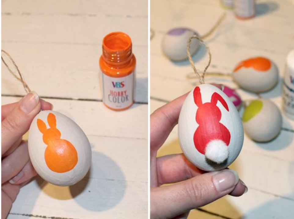
Once all the pom-poms are securely in place and the glue has dried, hang the eggs on the branch. Now, your colorful Easter decoration just needs a nice spot in your home.

After the base layer has dried, you can paint rabbits in different colors. Mine have two sizes to fit different fluffy tails. Once the paint has dried, stick on the white pom-poms. To do this, cut a small piece from the pom-pom, apply some glue there, and press it firmly against the rabbit.