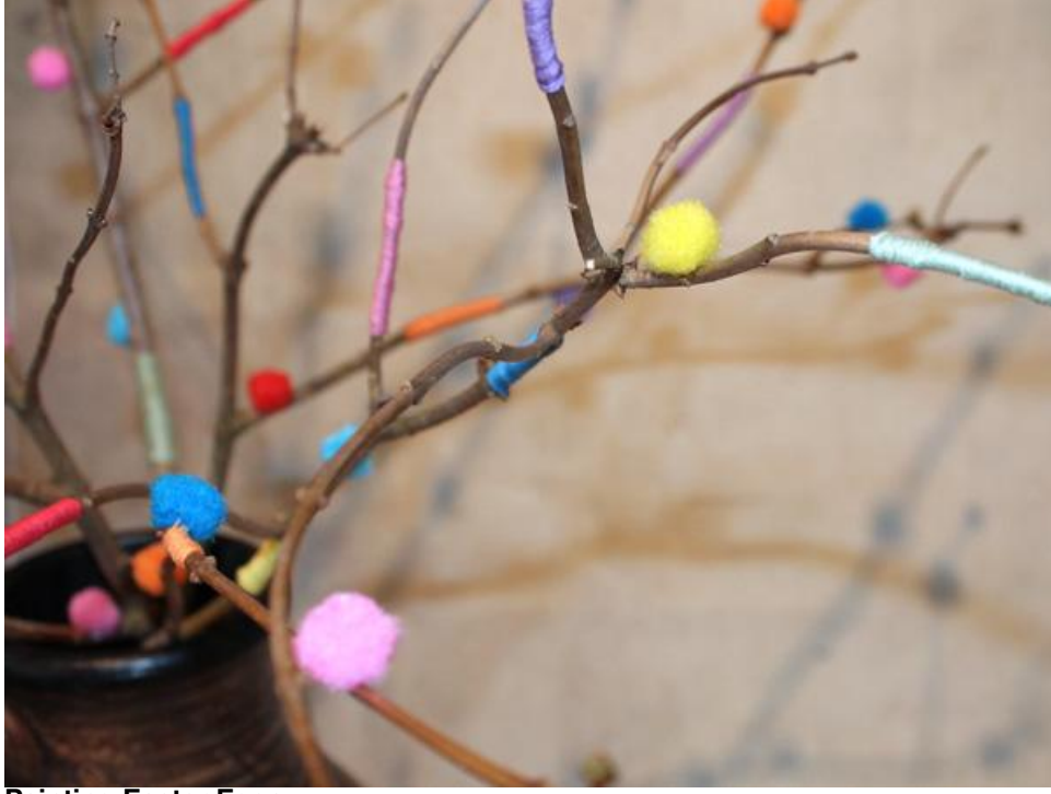
Painting Easter Eggs

Then, pick out the small pom-poms from the bulk pack and attach them to the branches. If you're using craft glue, you might need to press the pom-poms down a little longer. Hot glue works faster, but visible glue marks might appear.