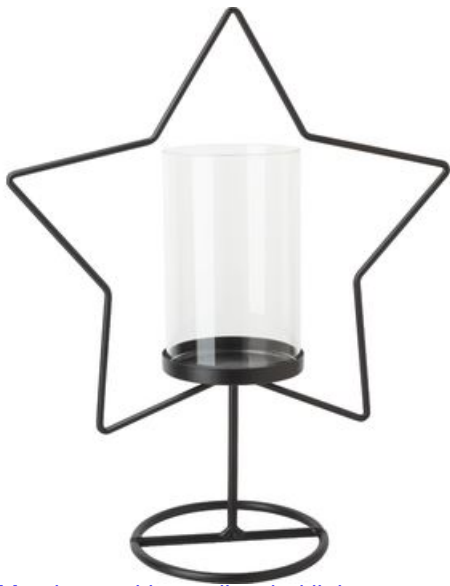
VBS Metal star with candle wind light