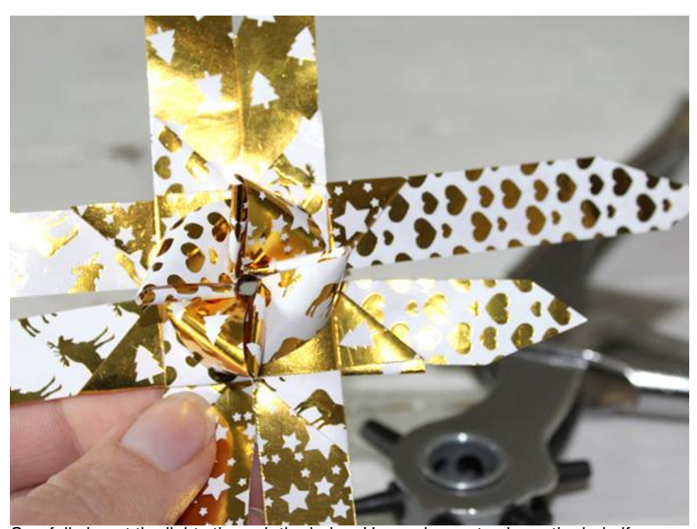
Carefully insert the lights through the holes. Use a skewer to shape the hole if necessary.

Use a hole punch to make holes in the middle of each star that match the size of the lights, so you can easily attach them.