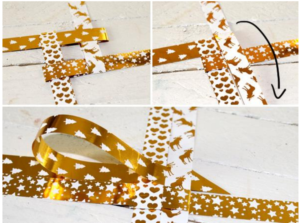
Step 2: Adding Flat Points

Take the top left strip and fold it parallel downwards to form a triangle. Slide the loose end under the neighboring slot and work your way around the star clockwise. Note: Always use the shorter left strip.