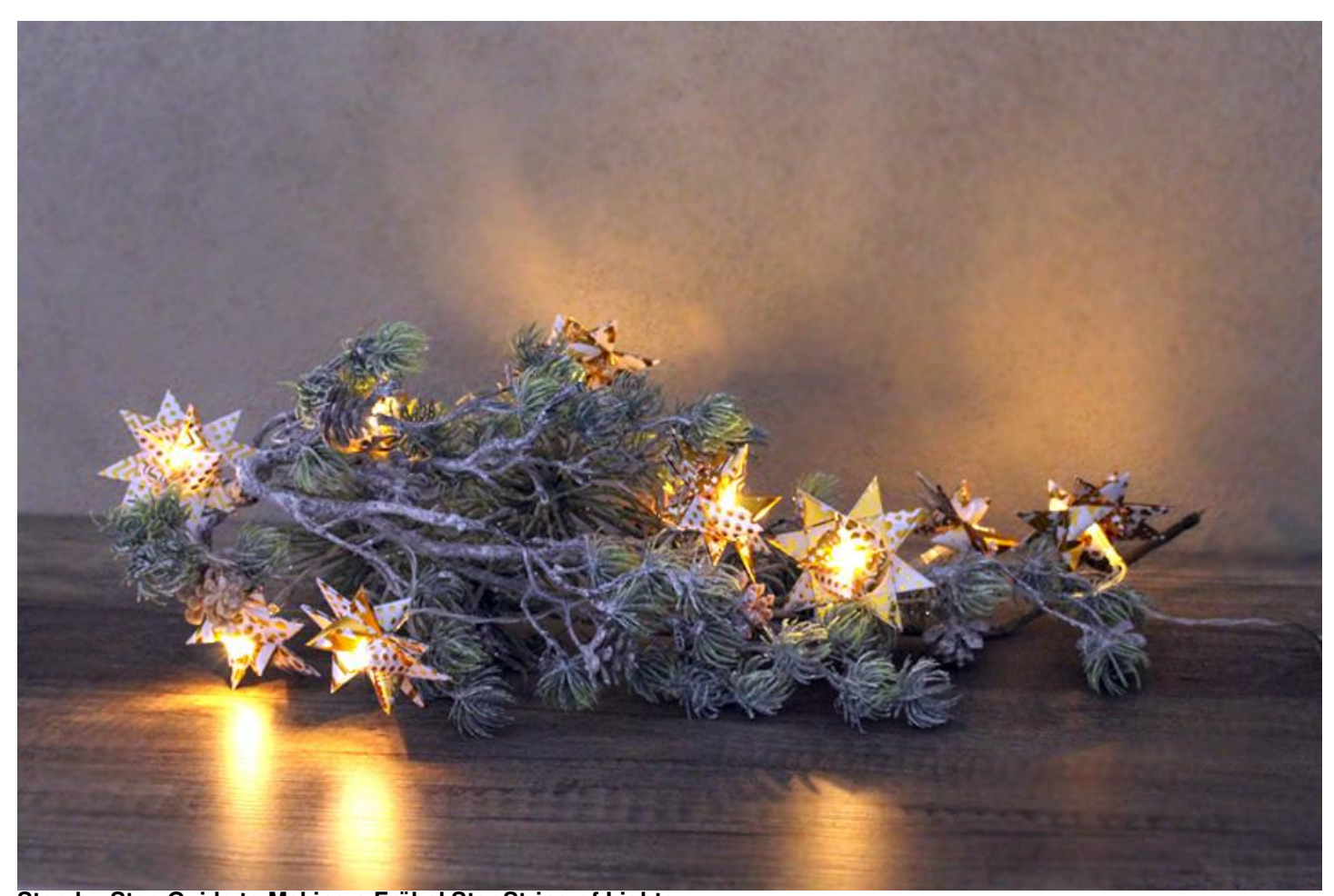
Step-by-Step Guide to Making a Fröbel Star String of Lights

The holiday season is approaching, and what could be more delightful than adorning your home with a homemade string of lights made from Fröbel stars? These traditionally popular paper stars are not only a charming decoration but also a wonderful way to bring a cozy and festive atmosphere to your home. In this guide, you'll learn how to fold Fröbel stars and assemble them into a sparkling string of lights. This will make your Christmas decoration truly unique!