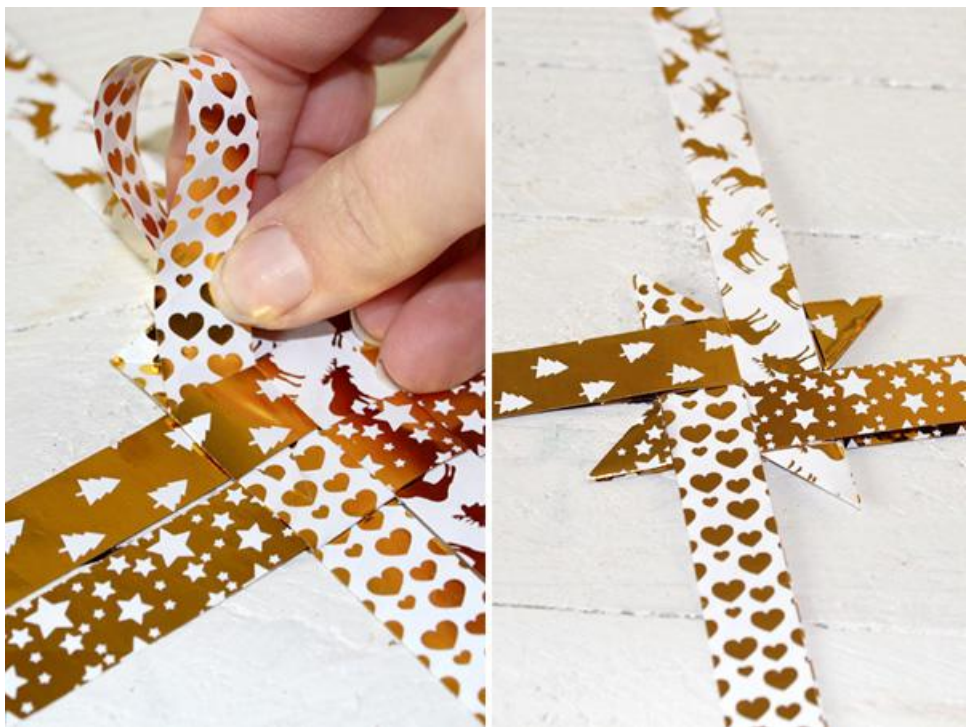
Step 3: Forming Three-Dimensional Points

Fold one strip down and twist another to slide it into the slot. Cutting the ends at an angle can facilitate threading. It is crucial that the strip reappears on the inside; otherwise, it cannot be pulled through.