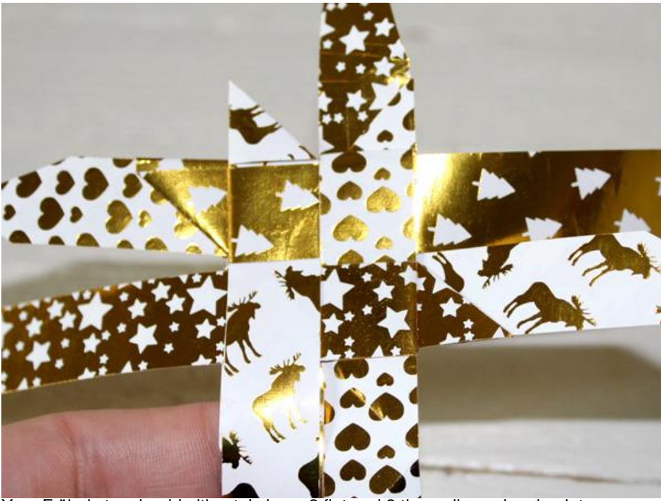
Your Fröbel star should ultimately have 8 flat and 8 three-dimensional points.