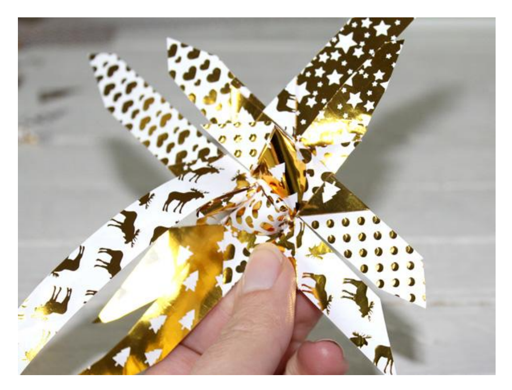
Pull the strip through until a three-dimensional point is formed. Work your way counterclockwise around the star until all points are shaped.