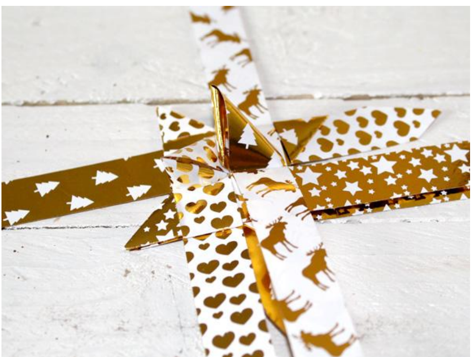
Step 4: Turn and Repeat with Stars

Once you have created 4 flat and 4 three-dimensional points, turn the star over and repeat the steps for the back side.