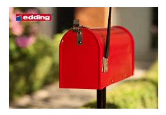
Here's how it works

Simply label and paint lantern foils with edding® pens and then create beautiful Lanterns! Let this idea from the house of edding® inspire you to make your own creations.