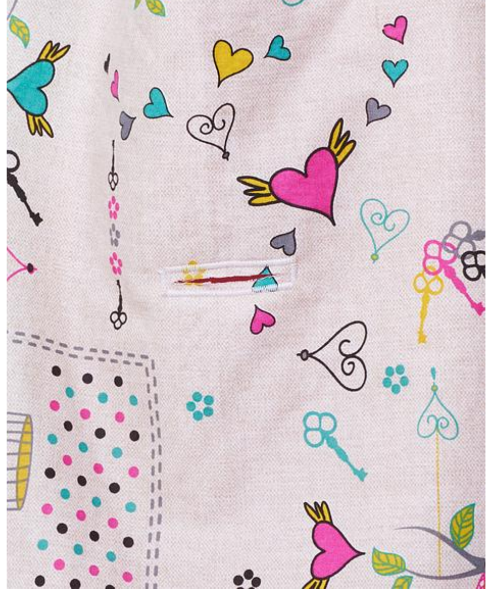
Belt slot for the baby car seat On Pattern there is a marking for the belt slot. This is transferred to the back of the finished blanket and is made like a buttonhole: sewed around with a zigzag stitch and finally carefully cut in.