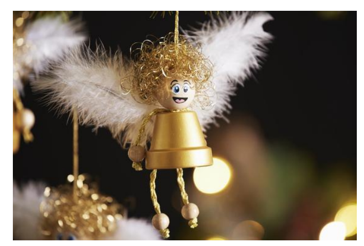
You will love this golden Christmas crafting fun!

Create beautiful angels for your Christmas decorations or as guardian angels for your loved ones. The cute angels are also great for children - fun for the whole family!