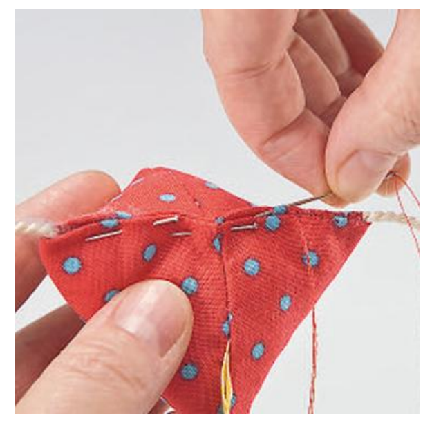
Sew in legs

For the beak check ribbon is folded in half and placed diagonally into the fabric folded to the right.