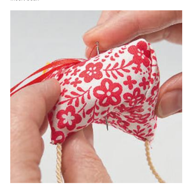
Hanging tape and sew in shape